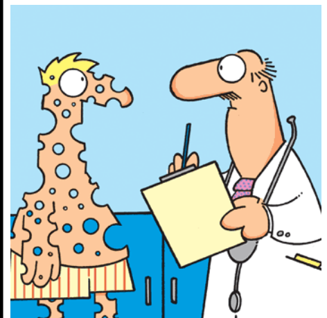
"I've lost 60kgs on the Swiss Cheese Diet"

The God of today's gospel text is not a vague and distant God but one who is in an intimate relationship of love—that of a father. If ordinary parents know what is good for their children and want to give them all that is good, how much more will our Father in heaven give us what we need. Asking our Father for the things that we need (rather than the things we want) is an expression of our dependence on God. To ask is to place ourselves in a state of cooperation with God. We also have to commit ourselves to working towards that which we pray for or else prayer becomes a way of evading responsibility and we make God into some kind of Santa Claus.